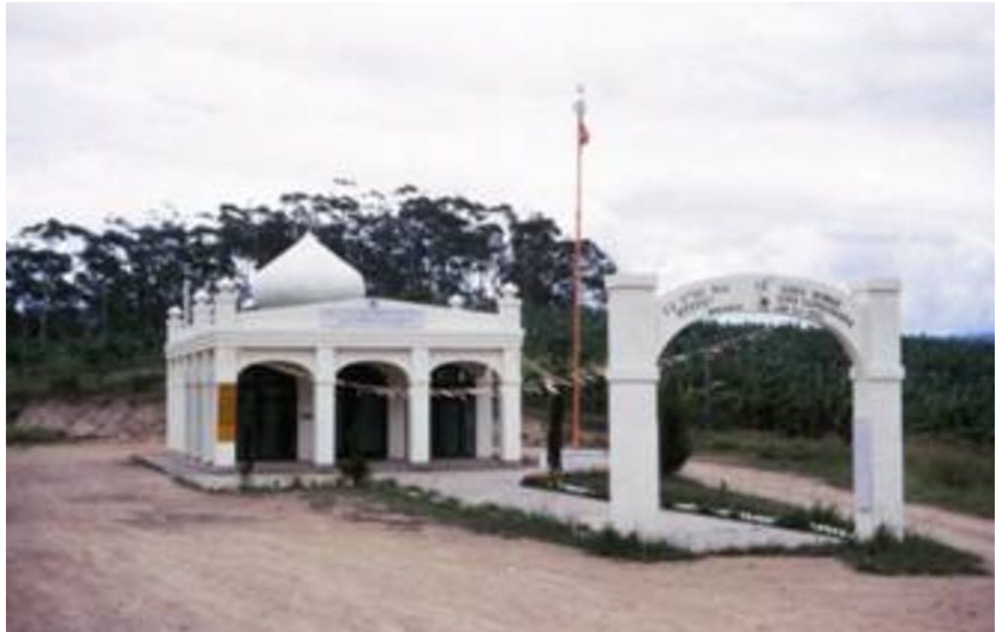
Australia's first Sikh Temple, built in 1968 in Woolgoolga, and is now heritage listed.